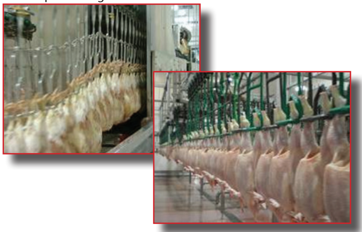
Figure 1: Clean birds showing no signs of fecal contamination on the processing line.

Feed withdrawal plans should be monitored and reviewed constantly and must be modified promptly if problems occur, but as a general rule of thumb, feed should be removed from the flock 8-12 hours before the expected processing time.