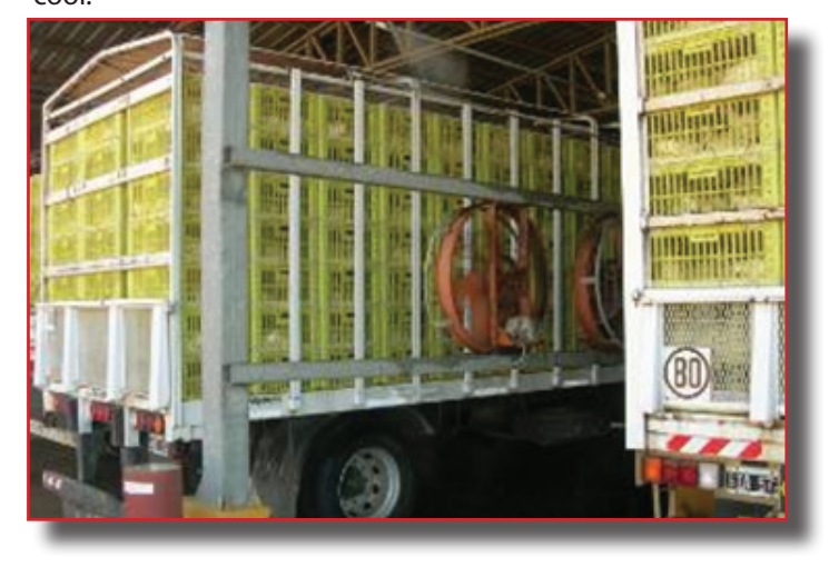
Figure 6: Fans being used in the holding area to keep birds cool.

During periods of high temperature, foggers can be used to help keep birds cool. Foggers must be well-maintained, and should not be used when relative humidity is greater than 70% because the capacity of birds to lose heat will be compromised. If foggers are used, it is important to make sure birds are dry when placed on the processing line. If birds are wet, the effectiveness of the electrical bath stunner may be reduced - compromising bird welfare and carcass quality.