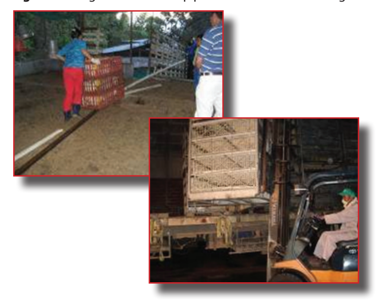
Figure 3: Using a forklift or PVC pipes to ease manual catching.

Methods of manual catching vary from country to country depending on equipment and labor availability. Manual catching crews typically catch and crate between 7,000-10,000 birds an hour. However, personnel can be subject to fatigue and may perform inconsistently during a shift. The use of forklift trucks to bring transport modules into the house, or PVC pipes to aid movement of transport modules through the house ( Figure 3 ), can make manual catching easier.