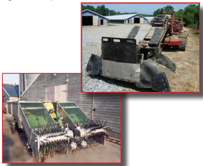
Figure 2: Examples of mechanical harvesters.

Methods of manual catching vary from country to country depending on equipment and labor availability. Manual catching crews typically catch and crate between 7,000-10,000 birds an hour. However, personnel can be subject to fatigue and may perform inconsistently during a shift. The use of forklift trucks to bring transport modules into the house, or PVC pipes to aid movement of transport modules through the house ( Figure 3 ), can make manual catching easier.