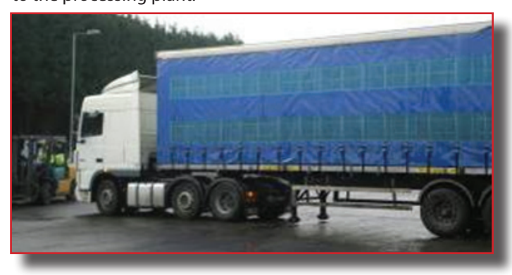
Figure 4: Example of a vehicle suitable for transporting broilers to the processing plant.

The micro-climate inside the bird compartment of the truck will be different to the temperature and humidity outside, and could be detrimental to the birds. This is especially true when the vehicle is stationary. Ventilation and extra heating and/or cooling should be used when necessary. Stops during transportation should be minimized.