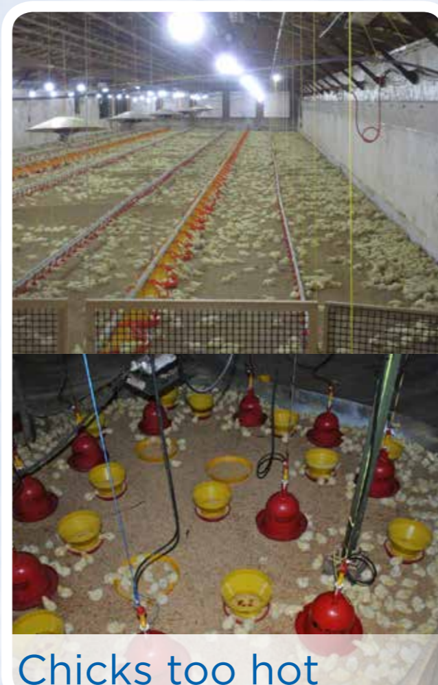
Chicks too hot